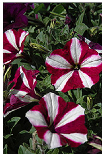
Easy Wave Burgundy Star Petunia flowers

Easy Wave Burgundy Star Petunia is recommended for the following landscape applications;