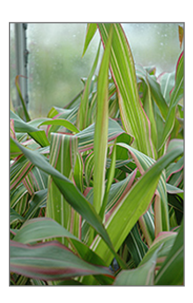
Field Of Dreams Ornamental Corn foliage

This plant does best in full sun to partial shade. It prefers to grow in average to moist conditions, and shouldn't be allowed to dry out. It is not particular as to soil type or pH. It is somewhat tolerant of urban pollution. This is a selection of a native North American species.