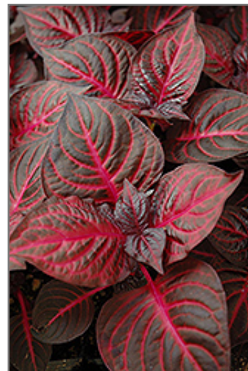
Blazin' Rose Blood Leaf foliage