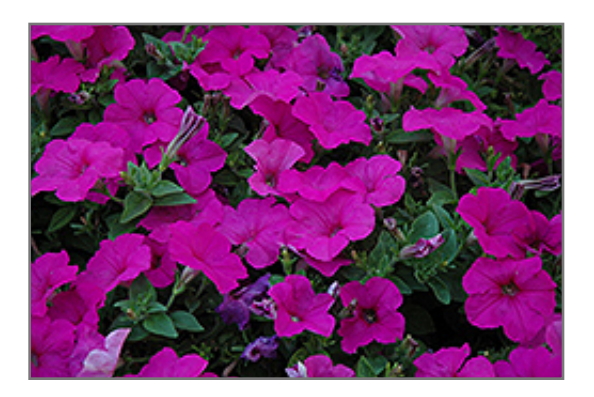
Easy Wave Neon Rose Petunia flowers