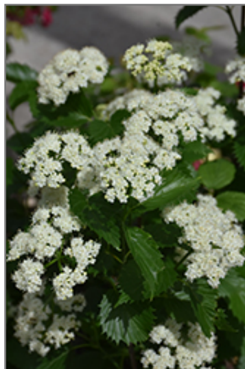
Blue Muffin Viburnum flowers