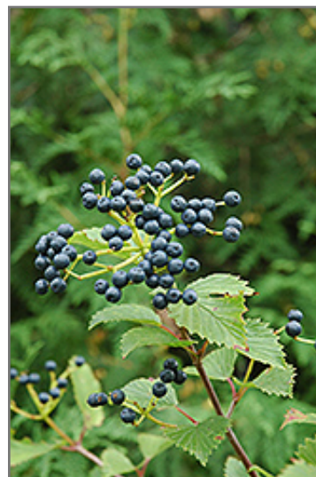
Blue Muffin Viburnum fruit

Blue Muffin Viburnum is recommended for the following landscape applications;