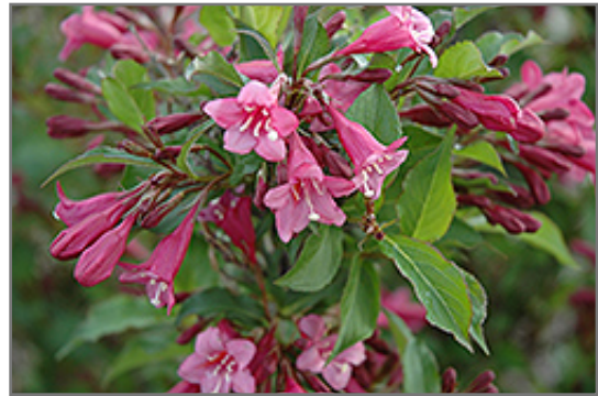
Rumba Weigela flowers