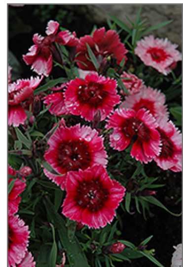
Super Parfait Raspberry Pinks flowers