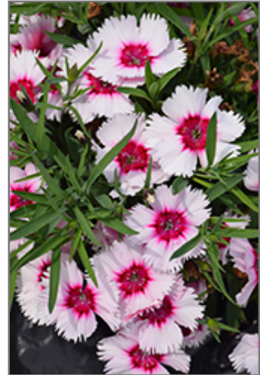
Super Parfait Raspberry Pinks flowers

Super Parfait Raspberry Pinks is a fine choice for the garden, but it is also a good selection for planting in outdoor pots and containers. It is often used as a 'filler' in the 'spiller-thriller-filler' container combination, providing a mass of flowers and foliage against which the thriller plants stand out. Note that when growing plants in outdoor containers and baskets, they may require more frequent waterings than they would in the yard or garden. Be aware that in our climate, most plants cannot be expected to survive the winter if left in containers outdoors, and this plant is no exception. Contact our experts for more information on how to protect it over the winter months.