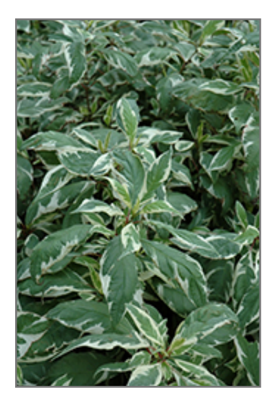
Cream Cracker Dogwood foliage

Cream Cracker Dogwood is a multi-stemmed deciduous shrub with a more or less rounded form. Its average texture blends into the landscape, but can be balanced by one or two finer or coarser trees or shrubs for an effective composition.