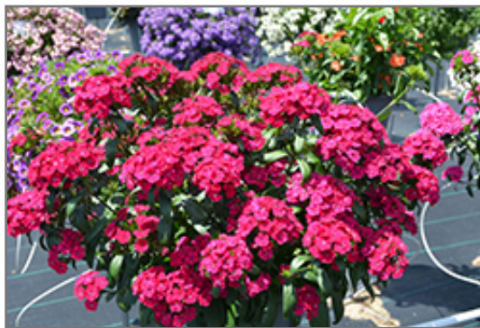
Jolt Cherry Hybrid Pinks in bloom