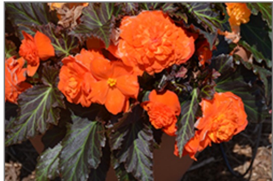
Nonstop Mocca Bright Orange Begonia flowers