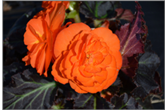
Nonstop Mocca Bright Orange Begonia flowers

Nonstop Mocca Bright Orange Begonia is recommended for the following landscape applications;