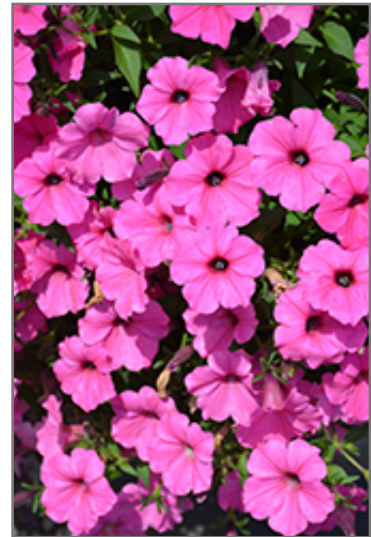
ColorRush Pink Petunia flowers

ColorRush Pink Petunia is recommended for the following landscape applications;