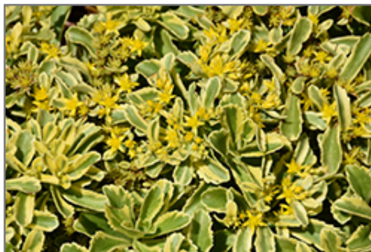
Cutting Edge Stonecrop flowers