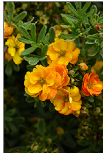
Marmalade Potentilla flowers

Marmalade Potentilla is recommended for the following landscape applications;