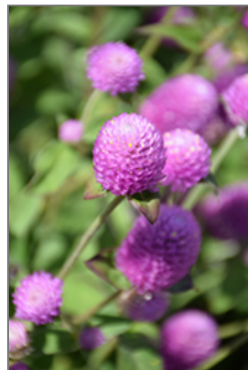
Ping Pong Lavender Globe Amaranth flowers

Ping Pong Lavender Globe Amaranth is recommended for the following landscape applications;