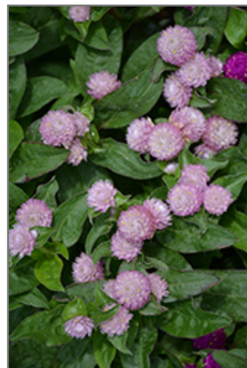
Ping Pong Lavender Globe Amaranth flowers