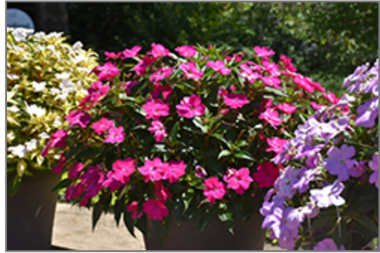
SunPatiens Vigorous Rose Pink New Guinea Impatiens in bloom

SunPatiens Vigorous Rose Pink New Guinea Impatiens is a fine choice for the garden, but it is also a good selection for planting in outdoor containers and hanging baskets. Because of its height, it is often used as a 'thriller' in the 'spiller-thriller-filler' container combination; plant it near the center of the pot, surrounded by smaller plants and those that spill over the edges. It is even sizeable enough that it can be grown alone in a suitable container. Note that when growing plants in outdoor containers and baskets, they may require more frequent waterings than they would in the yard or garden.