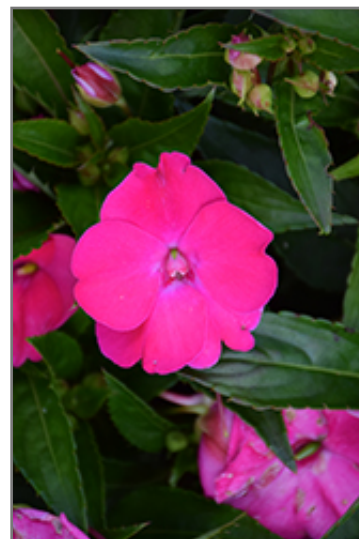
SunPatiens Vigorous Rose Pink New Guinea Impatiens flowers

This plant will require occasional maintenance and upkeep, and should not require much pruning, except when necessary, such as to remove dieback. It has no significant negative characteristics.