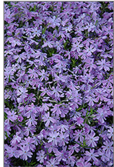
Emerald Blue Moss Phlox flowers