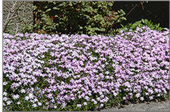
Emerald Blue Moss Phlox in bloom

This plant does best in full sun to partial shade. It prefers dry to average moisture levels with very well-drained soil, and will often die in standing water. It is considered to be drought-tolerant, and thus makes an ideal choice for a low-water garden or xeriscape application. It is not particular as to soil type, but has a definite preference for alkaline soils. It is highly tolerant of urban pollution and will even thrive in inner city environments. Consider covering it with a thick layer of mulch in winter to protect it in exposed locations or colder microclimates. This is a selection of a native North American species. It can be propagated by division; however, as a cultivated variety, be aware that it may be subject to certain restrictions or prohibitions on propagation.