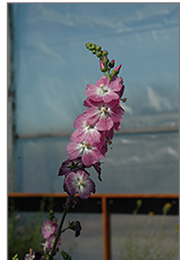
Stark's Hybrids Prairie Mallow flowers