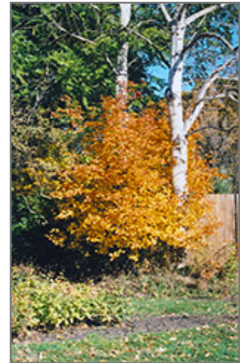
Saskatoon in fall