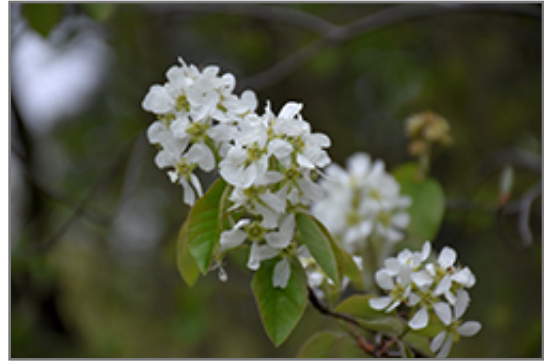
Saskatoon flowers

Saskatoon is a multi-stemmed deciduous shrub with an upright spreading habit of growth. Its relatively fine texture sets it apart from other landscape plants with less refined foliage.