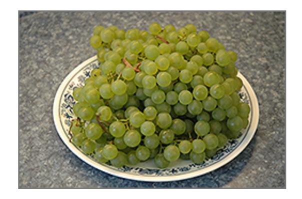
Morden 9703 Grape fruit