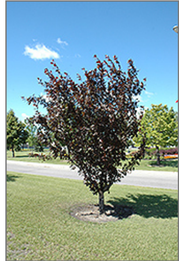
Thunderchild Flowering Crab

This tree should only be grown in full sunlight. It prefers to grow in average to moist conditions, and shouldn't be allowed to dry out. It is not particular as to soil type or pH. It is highly tolerant of urban pollution and will even thrive in inner city environments. This particular variety is an interspecific hybrid.