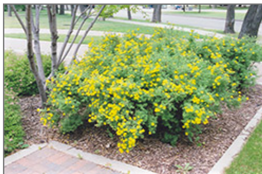
Coronation Triumph Potentilla in bloom