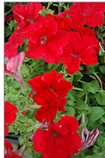
Dreams Red Petunia flowers