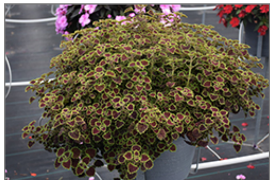
Burgundy Wedding Train Coleus