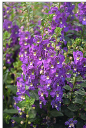
Archangel Purple Angelonia flowers

Archangel Purple Angelonia is recommended for the following landscape applications;