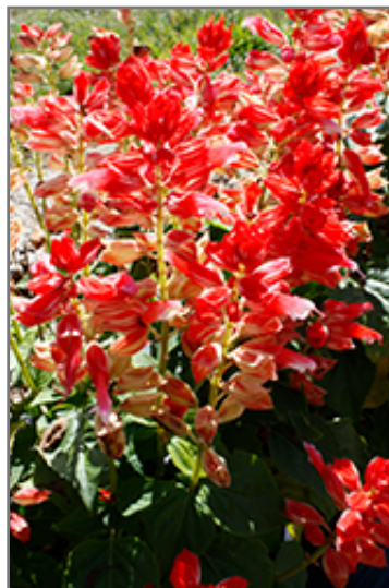
Vista Red And White Salvia flowers