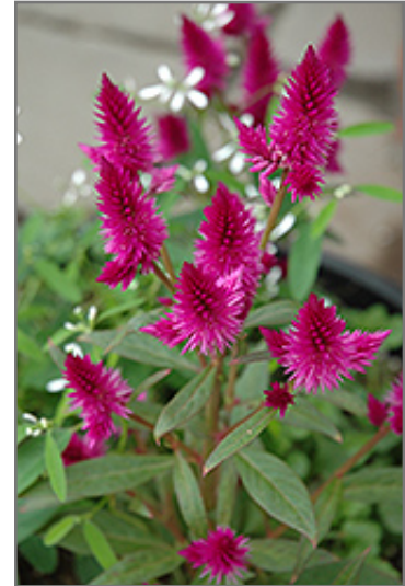
Intenz Classic Celosia flowers

Intenz Classic Celosia is recommended for the following landscape applications;