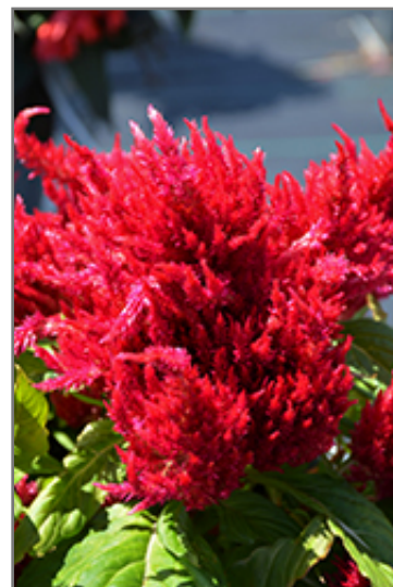
Ice Cream Cherry Celosia flowers

Ice Cream Cherry Celosia is recommended for the following landscape applications;