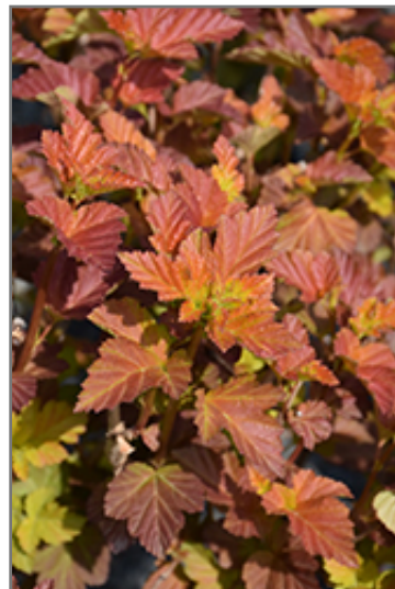
Amber Jubilee Ninebark foliage

This shrub will require occasional maintenance and upkeep, and can be pruned at anytime. It has no significant negative characteristics.