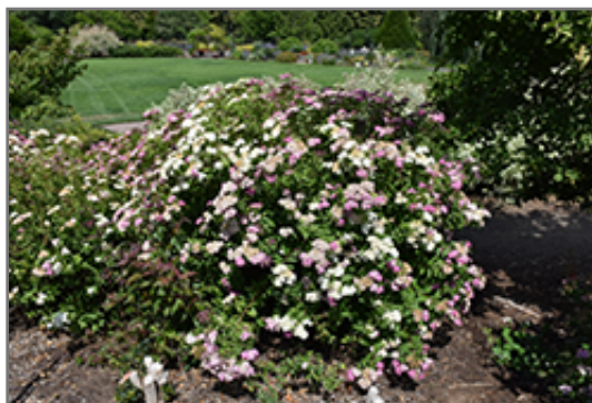
Shirobana Spirea in bloom