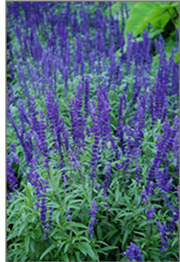
Victoria Blue Salvia flowers

Victoria Blue Salvia is a fine choice for the garden, but it is also a good selection for planting in outdoor pots and containers. With its upright habit of growth, it is best suited for use as a 'thriller' in the 'spiller-thriller-filler' container combination; plant it near the center of the pot, surrounded by smaller plants and those that spill over the edges. Note that when growing plants in outdoor containers and baskets, they may require more frequent waterings than they would in the yard or garden.