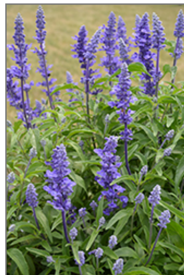
Victoria Blue Salvia flowers

Victoria Blue Salvia is recommended for the following landscape applications;