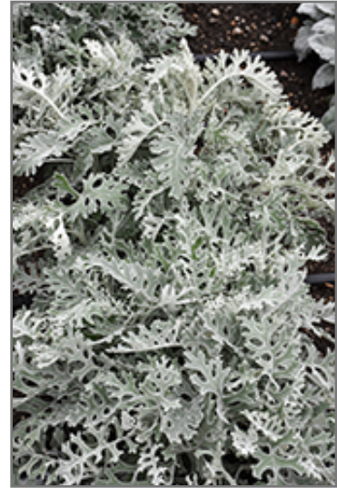
Silver Dust Dusty Miller foliage

Silver Dust Dusty Miller is a fine choice for the garden, but it is also a good selection for planting in outdoor containers and hanging baskets. It is often used as a 'filler' in the 'spiller-thriller-filler' container combination, providing a mass of flowers and foliage against which the larger thriller plants stand out. Note that when growing plants in outdoor containers and baskets, they may require more frequent waterings than they would in the yard or garden.