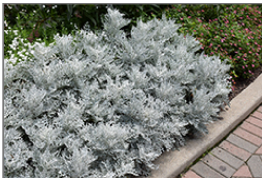
Silver Dust Dusty Miller

Silver Dust Dusty Miller is recommended for the following landscape applications;