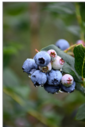
Chippewa Blueberry fruit

Chippewa Blueberry features dainty clusters of white bell-shaped flowers with shell pink overtones hanging below the branches in mid spring. It has green deciduous foliage. The glossy oval leaves turn an outstanding orange in the fall. It features an abundance of magnificent blue berries in mid summer.