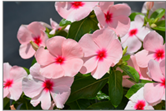
Titan Apricot Vinca flowers

Titan Apricot Vinca is recommended for the following landscape applications;