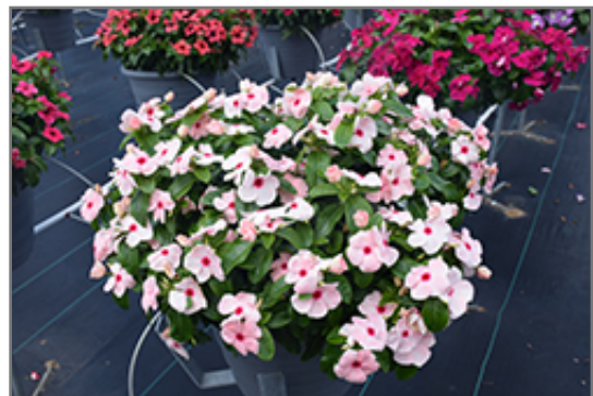
Titan Apricot Vinca in bloom