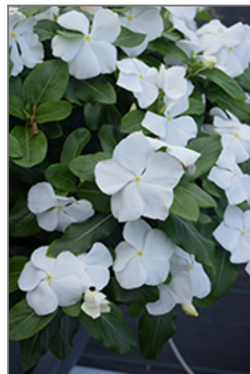
Titan Pure White Vinca flowers

Titan Pure White Vinca is recommended for the following landscape applications;