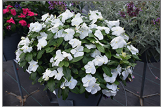
Titan Pure White Vinca in bloom

Titan Pure White Vinca will grow to be about 14 inches tall at maturity, with a spread of 12 inches. Its foliage tends to remain dense right to the ground, not requiring facer plants in front. Although it's not a true annual, this fast-growing plant can be expected to behave as an annual in our climate if left outdoors over the winter, usually needing replacement the following year. As such, gardeners should take into consideration that it will perform differently than it would in its native habitat.