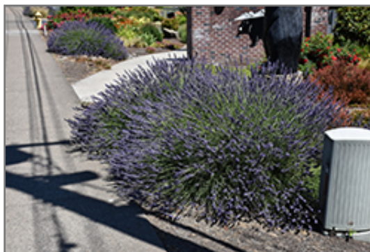
Phenomenal Lavender in bloom

This is a relatively low maintenance shrub, and can be pruned at anytime. It is a good choice for attracting butterflies to your yard, but is not particularly attractive to deer who tend to leave it alone in favor of tastier treats. It has no significant negative characteristics.