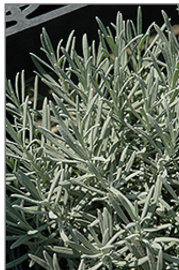
Phenomenal Lavender foliage

This plant is not reliably hardy in our region, and certain restrictions may apply; contact the store for more information.