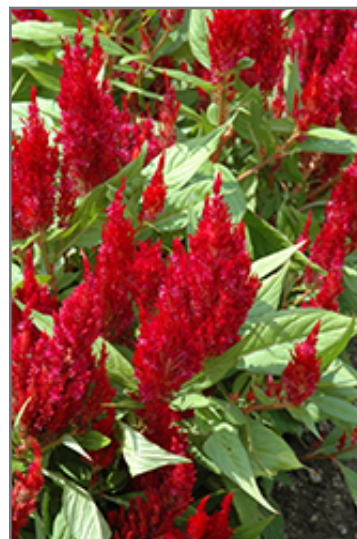
First Flame Red Celosia flowers

First Flame Red Celosia is recommended for the following landscape applications;