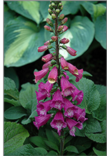
Candy Mountain Foxglove flowers