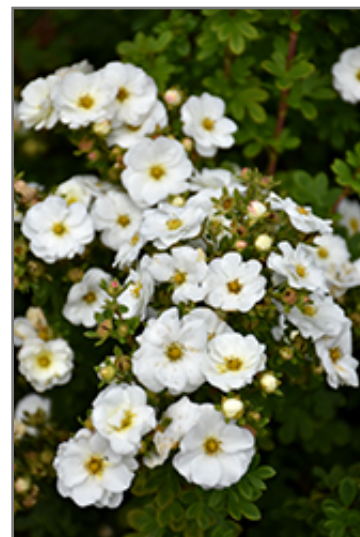
Morden Snow Potentilla flowers