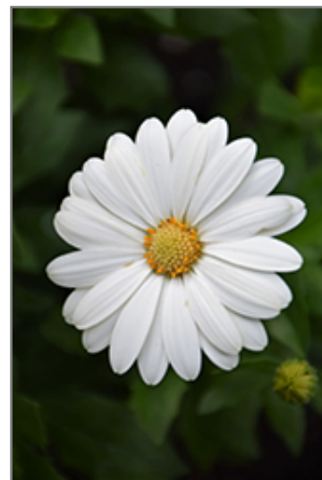
Akila Daisy White African Daisy flowers

Akila Daisy White African Daisy is recommended for the following landscape applications;