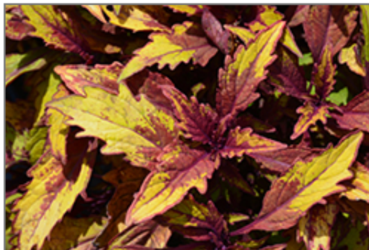
FlameThrower Spiced Curry Coleus foliage

FlameThrower Spiced Curry Coleus is recommended for the following landscape applications;