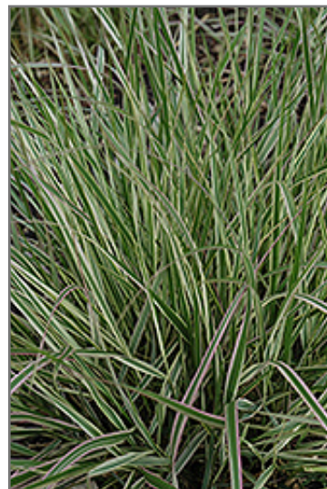
Variegated Reed Grass foliage