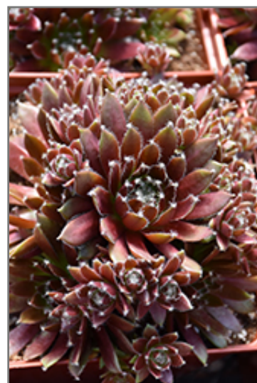
Chick Charms Cinnamon Starburst Hens And Chicks