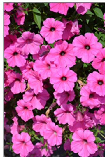
ColorRush Pink Petunia flowers

ColorRush Pink Petunia is recommended for the following landscape applications;