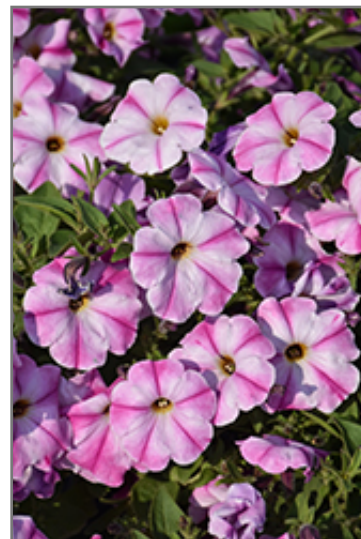
ColorRush Pink Star Petunia flowers