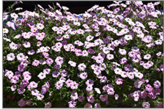
ColorRush Pink Star Petunia in bloom

ColorRush Pink Star Petunia will grow to be about 12 inches tall at maturity, with a spread of 30 inches. When grown in masses or used as a bedding plant, individual plants should be spaced approximately 24 inches apart. Its foliage tends to remain dense right to the ground, not requiring facer plants in front. This fast-growing annual will normally live for one full growing season, needing replacement the following year.