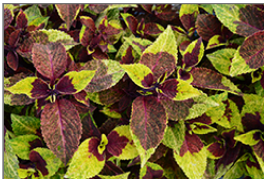
Premium Sun Pineapple Surprise Coleus foliage

Premium Sun Pineapple Surprise Coleus is recommended for the following landscape applications;