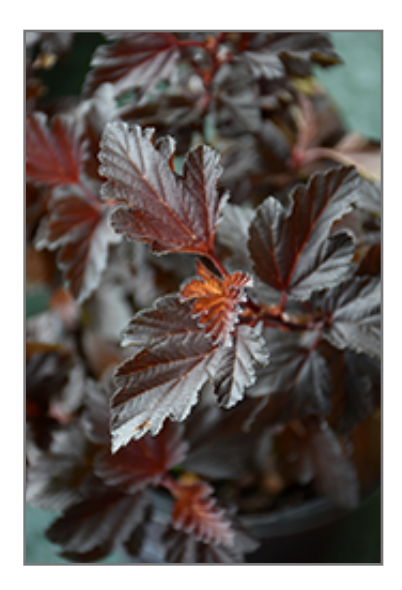
Fireside Ninebark flowers