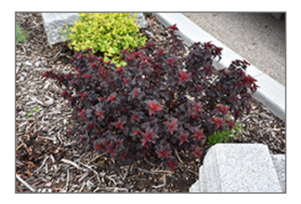
Fireside Ninebark

Fireside Ninebark is recommended for the following landscape applications;