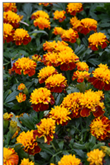
Hot Pak Spry Marigold flowers

Hot Pak Spry Marigold is recommended for the following landscape applications;