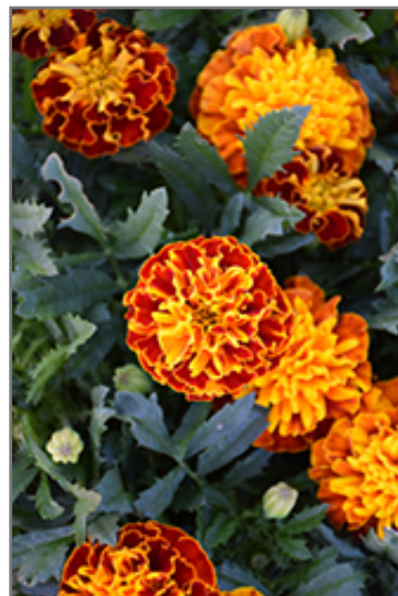
Hot Pak Spry Marigold flowers