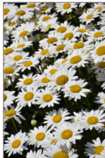
Becky Shasta Daisy flowers