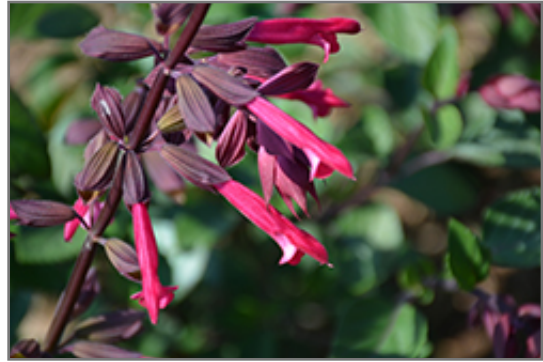
Skyscraper Dark Purple Salvia flowers