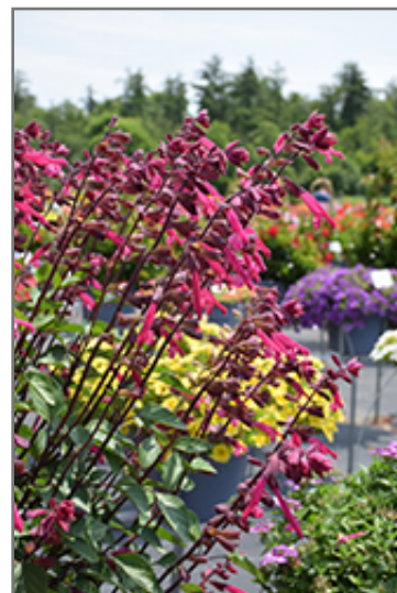
Skyscraper Dark Purple Salvia flowers

Skyscraper Dark Purple Salvia is an herbaceous annual with an upright spreading habit of growth. Its relatively fine texture sets it apart from other garden plants with less refined foliage.