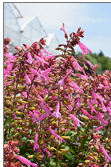
Skyscraper Pink Salvia flowers

Skyscraper Pink Salvia is an herbaceous annual with an upright spreading habit of growth. Its relatively fine texture sets it apart from other garden plants with less refined foliage.