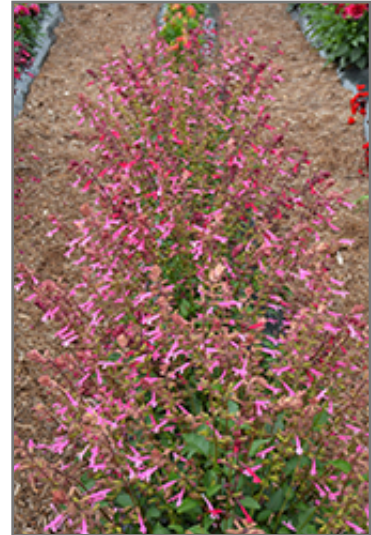
Skyscraper Pink Salvia in bloom

Skyscraper Pink Salvia is a fine choice for the garden, but it is also a good selection for planting in outdoor pots and containers. With its upright habit of growth, it is best suited for use as a 'thriller' in the 'spiller-thriller-filler' container combination; plant it near the center of the pot, surrounded by smaller plants and those that spill over the edges. Note that when growing plants in outdoor containers and baskets, they may require more frequent waterings than they would in the yard or garden.